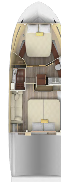
STATEROOMS, HEAD & SHOWER