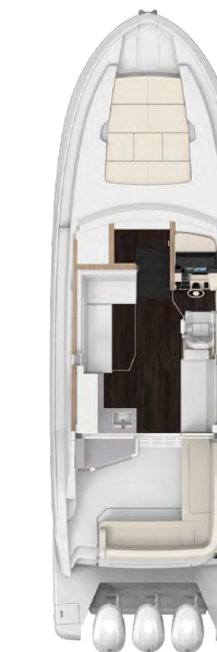
UPPER SALON AND AFT PATIO

Fully customizable displays provide full system and navigation control all in one place.