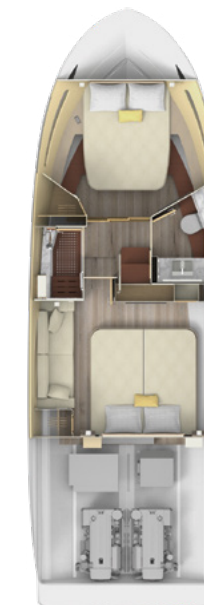
STATEROOMS, HEAD & SHOWER