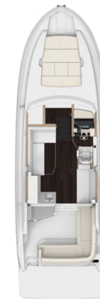
UPPER SALON AND AFT PATIO

Fully customizable displays provide full system and navigation control all in one place.